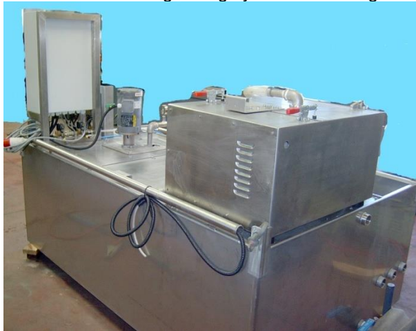
Stainless Steel systems for different applications.