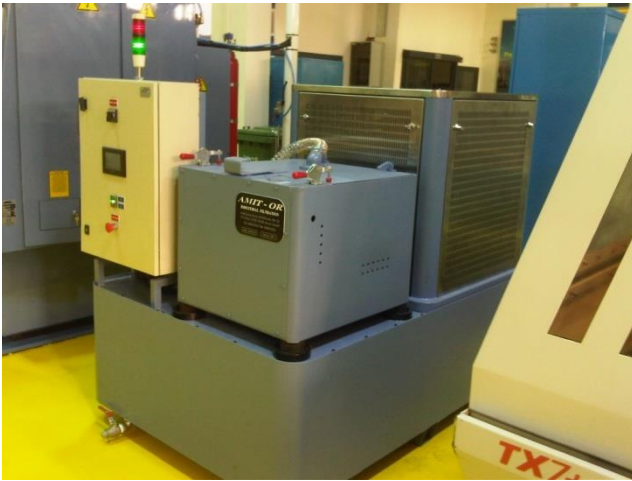
Carbide grinding system consisting of Centrifuge , Chiller, pumps for “ Anca “ Grinder