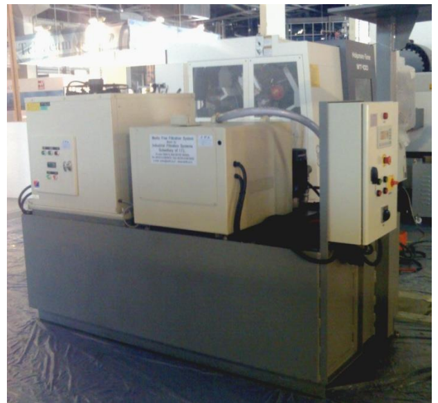
Std. System for Mihael Deckel carbide Grinder.