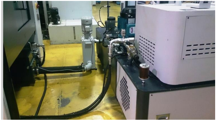
Aerospace Alloys Grinding System consisting of Centrifuge , Chiller, 70 Bar@30lpm and 40Bar@80lpm Hi Pressure pumps on " HAAS " Grinder