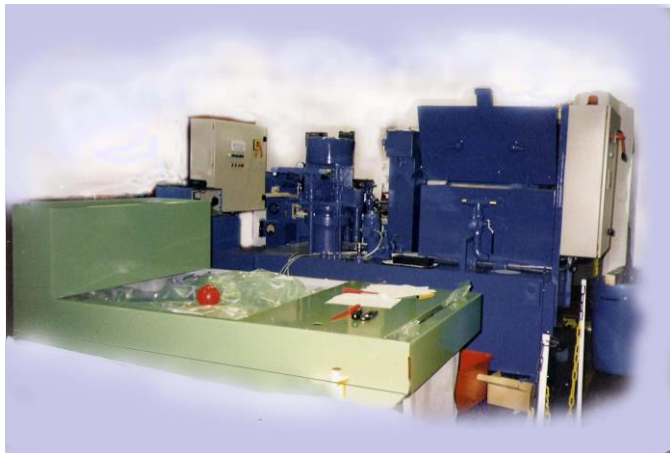
Combination of Centrifugal system